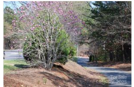
Beautiful walking trails